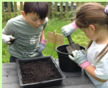
Why do we need to plant wild flowers?