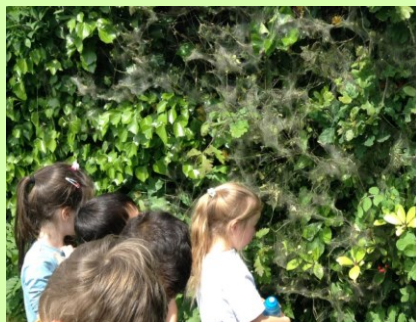
Why is this huge spider's web here?