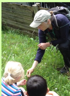
Can we remember the names of wild flowers?