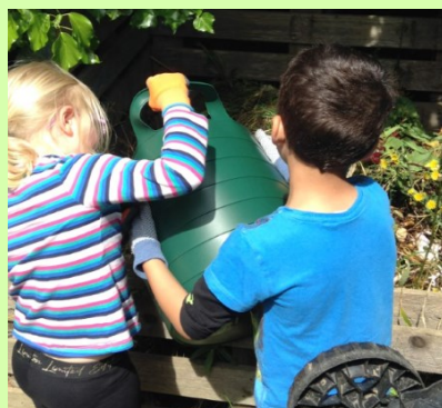
Why do we need to make our own compost?