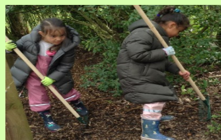
Why is it helpful to 'mulch' the soil?

These lessons combine physical activity—moving large quantities of mulch or compost or watering plants. The children learn about how we can support wildlife and plants. They also learn to plant or weed and lessons end with little quizzes to check what children are remembering.