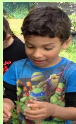
How do herbs taste?

The children are applying their learning from the National Curriculum to learn beyond it as we develop our sustainability and climate change curriculum.