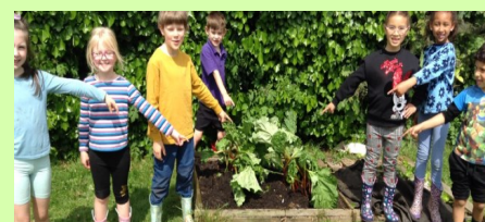
We planted rhubarb—We can eat it!