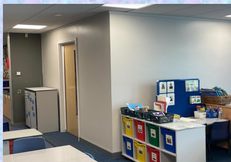
Entrance to new rooms. The main room is a teaching room for individuals and small groups.