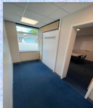
Sensory Room above—to be equipped with blackout blind, soft furnishings, twinkly lights and projector.

'Break the rules' results—£464.50 was raised for Comic Relief—Well done everyone!